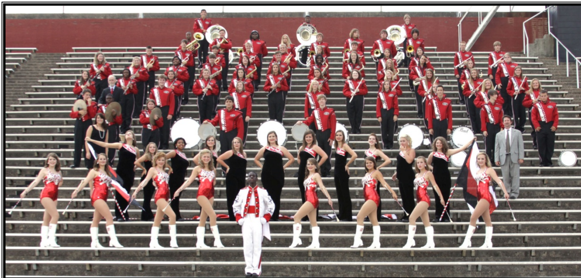
Sylacauga High School Marching Aggie Band Fall 2010